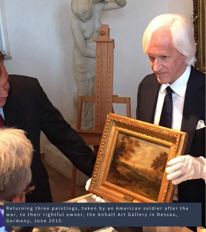
Returning three paintings, taken by an American soldier after the war, to their rightful owner, the Anhalt Art Gallery in Dessau, Germany, June 2015.